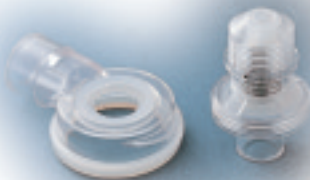
PEEP Valve & Diverter