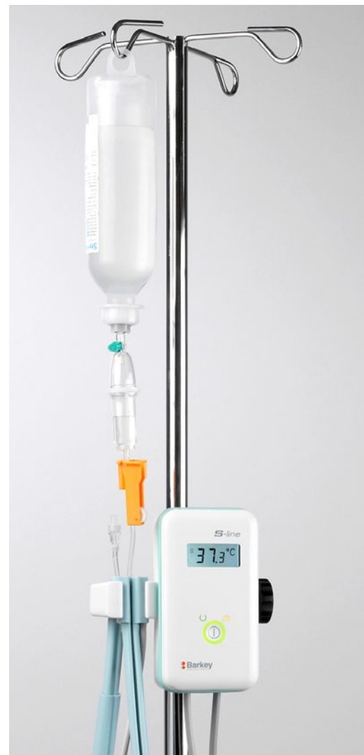
The accessories shown are not included in delivery.