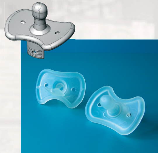
Pacifier for premature babies (from 1 to 2 kg)