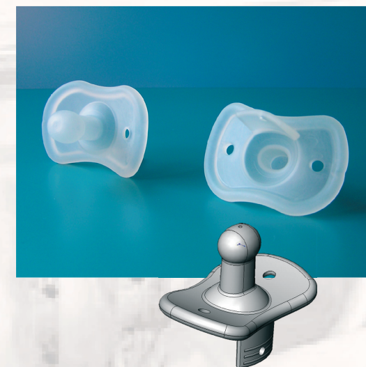
Pacifier for newborn (> 2 kg and ≤ 6 kg)

In order to reduce the risk of contamination and infection in the hospital environment, the disposable pacifiers are presented as single use products. The Beldico pacifiers are delivered individually wrapped and gamma treated.