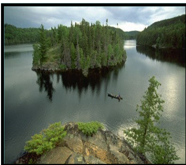
Boundary Waters, Minnesota

Another place to see is Taylor Falls. A small town between two beautiful state parks it offers everything from bird watching to hiking trails. This is a place to explore if your looking for outdoor fun.