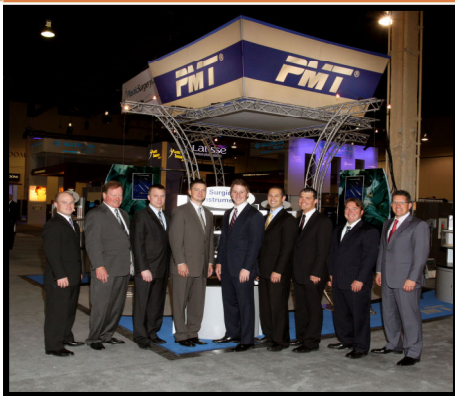
ASAPS 2009, Las Vegas, Nevada, USA

ASAPS and the SPSSCS in Las Vegas are just a couple of the trade shows PMT attended this year. With 2400 members, the ASAPS (The American Society for Aesthetic Plastic Surgery) is the leading professional organization of plastic surgeons who specialize in cosmetic plastic surgery.