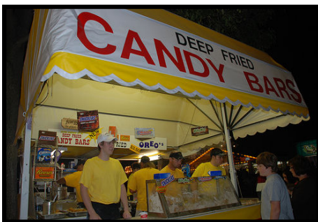
Deep Fried Candy Bars booth at the Minnesota State Fair!

SPSSCS (The Society of Plastic Surgical Skin Care Specialists) is another trade show PMT attended this year. PMT/Permark had two workshops focusing on our permanent make up products.