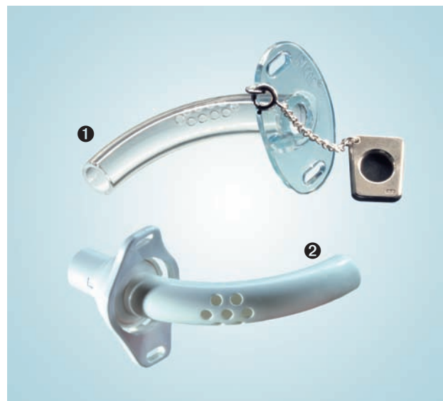
► FIGURE 3 Tubes with multiple fenestration designs: ❶ TRACOE comfort REF 103, ❷ TRACOE twist REF 304