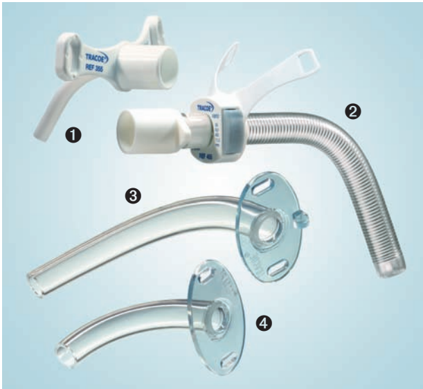
► FIGURE 2 Cuffless tubes*: ❶ TRACOE mini REF 355, ❷ TRACOE vario REF 455, ❸ TRACOE com- fort REF 201, ❹ TRACOE comfort REF 101