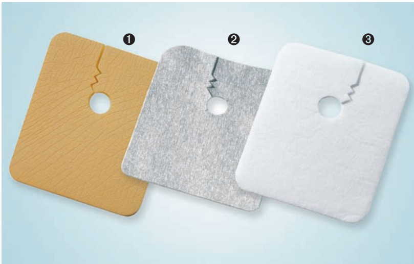
► FIGURE 8 ① TRACOE purofoam tracheostomy dressing, ② TRACOE tracheal compress, aluminium coated, ③ TRACOE coated tracheal compress