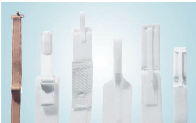
▶ FIGURE 7 TRACOE neck straps*

It is imperative that the area around the stoma is kept clean and dry in order to prevent infection. This is why the neck straps* must always be changed whenever they become wet or soiled, or once a day at least. Wet or soiled neck straps* can cause skin irritations (e.g. macerations) and must be avoided under all circumstances.